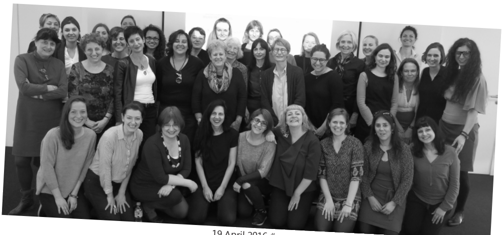
19 April 2016 #womensvoices forum

Let’s shift from a culture of disbelief and conflict to an assumption of belief and a culture of protection and peace! Together, we can build real peace for women and girls!